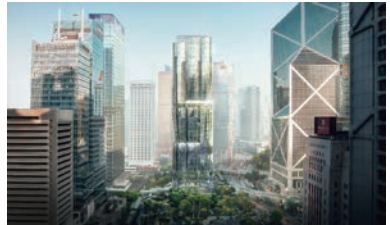
The Henderson, Hong Kong by Zaha Hadid Architects for Henderson Land Render by Arqui9 恒基地產The Henderson由「扎哈•哈迪德建築事務所」設計 效果圖由Arqui9製作

The Henderson, which is expected to be completed in 2023, has already received numerous awards and accolades, including the Grand Award (New Buildings Category: Projects Under Construction and/or Design - Commercial) at Green Building Award 2021 and Platinum Pre-certifications in both WELL Building Standard (WELL) and Leadership in Energy and Environmental Design (LEED). The project has also been awarded Platinum certifications for both WiredScore and SmartScore, in recognition of its outstanding digital connectivity and advanced smart technology.