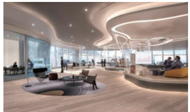
Upon its scheduled completion in 2023, The Henderson is poised to become a sustainable workplace of the future with an all-embracing ESG ecosystem. (For reference only and subject to further design development) The Henderson預計於2023年年底落成，屆時將成為具備全方位ESG生態系統、可持續的劃時代辦公空間。(此效果圖僅供參考及將以最終設計圖則為準)

項目至今已贏得眾多獎項與榮譽，包括環保建築大獎2021新建建築類別(興建及/或設計中項目-商業)大獎、WELL健康建築標準認證及領先能源與環境設計(LEED)的鉑金級前期認證，更榮獲WiredScore及SmartScore「雙鉑金」智能設計認證，充分展現項目在數碼通訊和物業智能技術上的卓越成就。